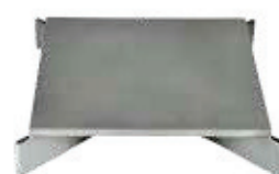
plate - P