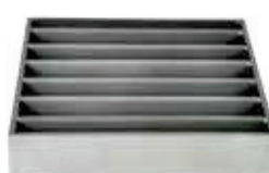
ladder - D