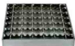
mesh anti-slip - K