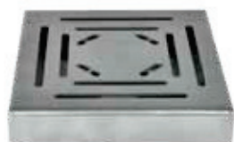
perforated sheet - B